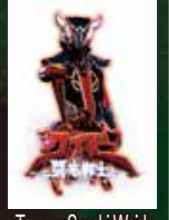
Tougyu Senshi Waido